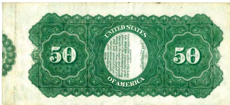
Illustration courtesy of Heritage Auction Galleries.