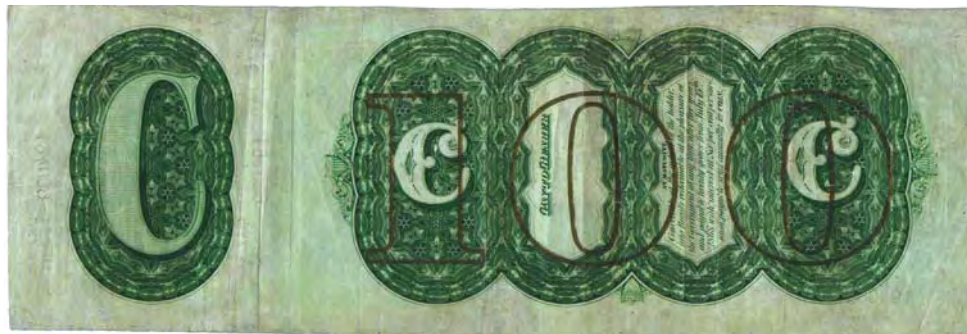
Illustration courtesy Heritage Auction Galleries.

212e. 100 Dollar Note. Issued June 15, 1865