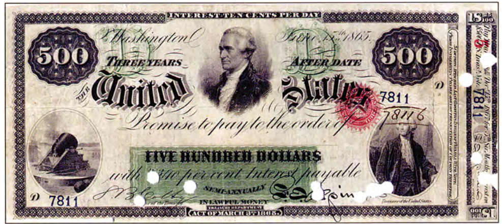
Illustration of a canceled note

Bust of Alexander Hamilton at top center. Mortar at left, half-length bust of George Washington at right.