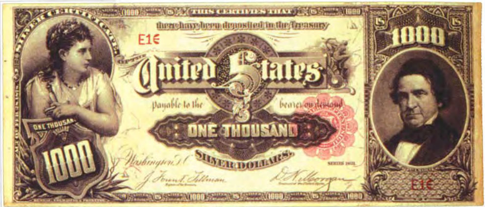
Illustration courtesy of Martin Gengerke.