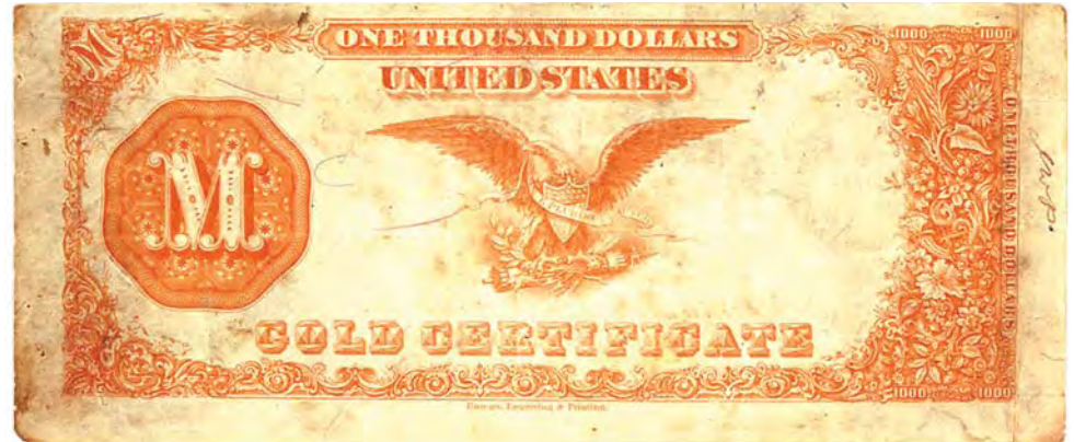
Illustration courtesy of Martin Gengerke.