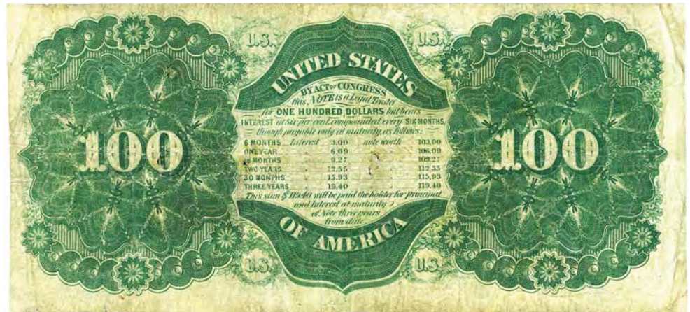
Illustration courtesy Heritage Auction Galleries.